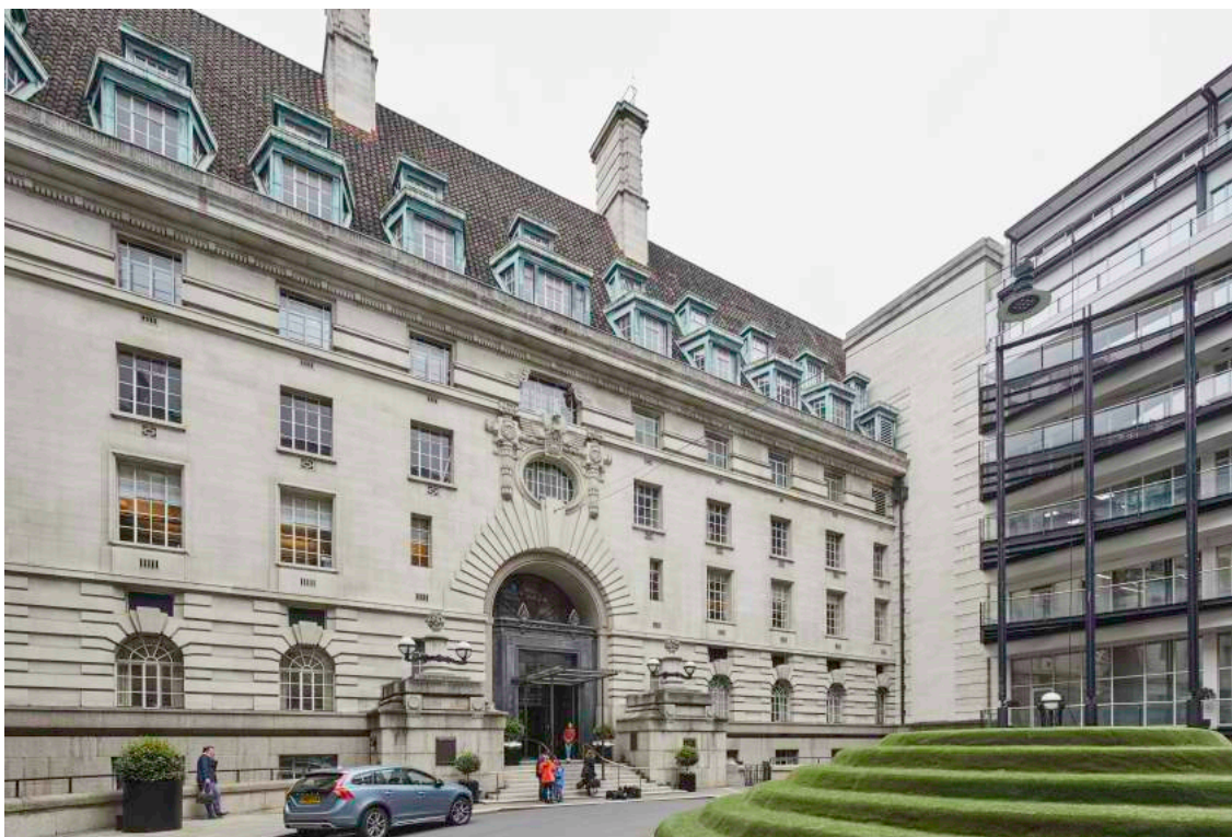
Above: London Marriot Hotel County Hall