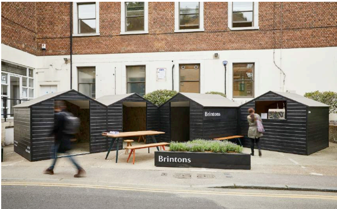
Brintons pop-up showroom, 132 Goswell Road at Clerkenwell Design Week 2017