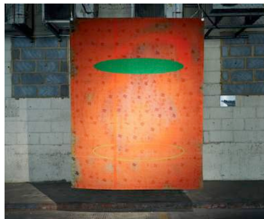
Joe Versus the Volcano by Shezad Darwood (2017), woven by Brintons