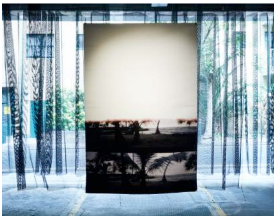
Multiple White-Out Palms by Shezad Darwood (2017), woven by Brintons