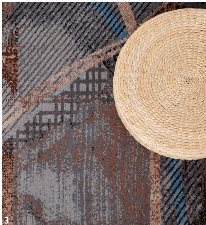
Pictured 1: Q01/A057086PA | Pictured 2: Q01/A056612PA | Pictured 3: Q01/A056640PA