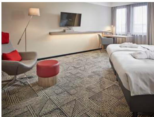
X5830IN from the Inspirations Collection