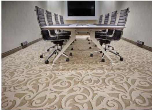
Gold Atholl Gardens design from the Timorous Beasies Collection