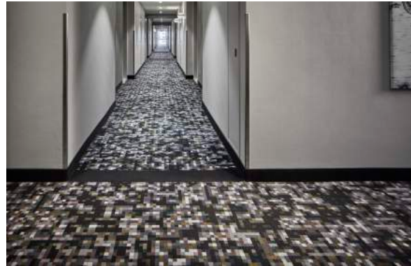
3/X5228CZ from the Zuzunaga Deep Grid collection