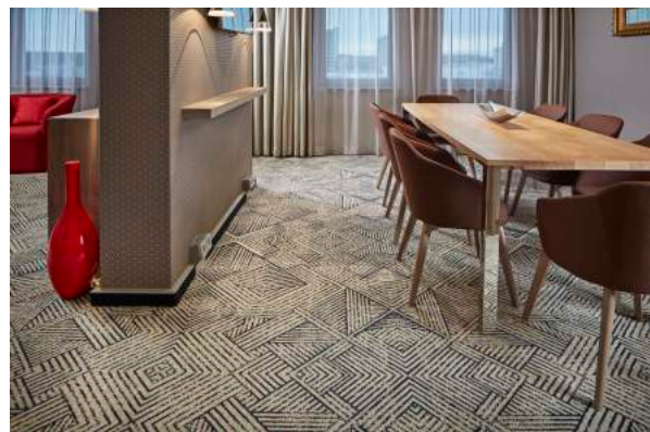
X5830IN from the Inspirations Collection