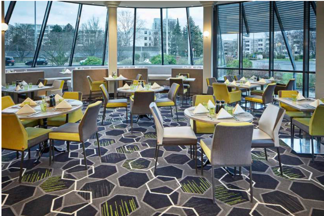
Winter Garden – custom Brintons design

Internationally renowned H4 Hotels have commissioned premium carpet manufacturer Brintons to design carpets for luxury 4 star hotel, Hannover Messe. Strongly influenced by the close proximity to Hannover's business centre, Brintons created carpets to suit the modern feel combined with structures and textures of nature.