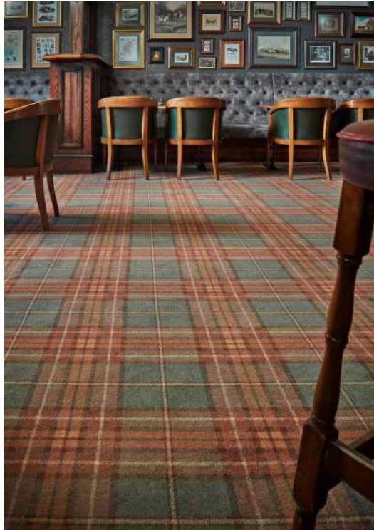
Cavan Plaid from the Abbeyglen collection