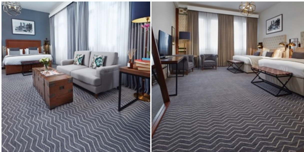
Custom Brintons design in guestrooms of The Principal Manchester

Principal Hotel Company Ltd and Starwood Capital Group commissioned premium carpet manufacturer Brintons to design the carpets for luxury 4 star hotel, The Principal Manchester. Brintons created bespoke carpets to suit the hotel's colour palettes and listed period details.